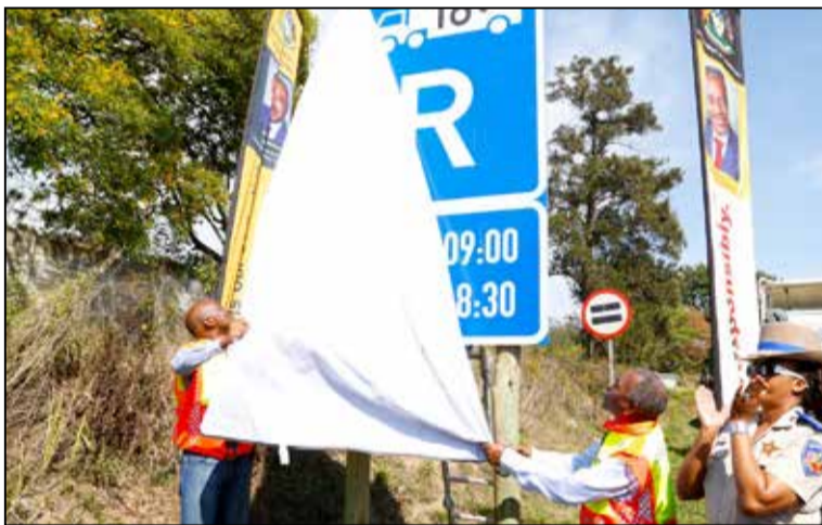
UMnuz Willies Mchunu uvule ngokusemthethweni izimpawu ezilawula ukuhamba kwamaloli emgwaqeni u-M13 e-Pinetown. Lo mgwaqo udume kakhulu ngezingozi ezibandakanya amaloli.